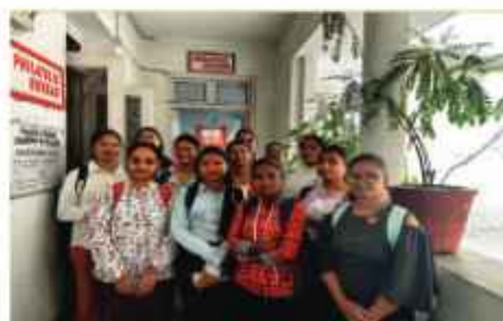
Visit to Philatelic Museum by Department of Office Management and Secretarial Practice