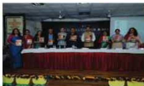
ICHR Sponsored National Seminar by Department of History