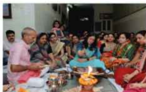
Starting the New Session with Havan Yajna