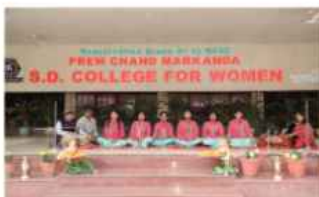
Group Bhajan by Department of Music