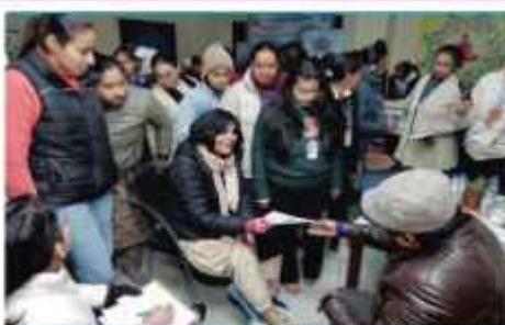
Bone Density Check-Up Camp