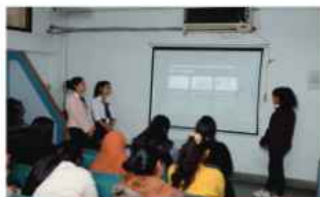
Power Point Presentations by Students of Department of Computer Science & IT