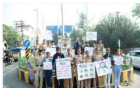
Awareness Programme on International Millets Day