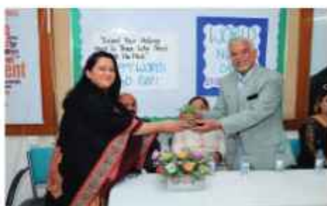
World NGO Day Celebration