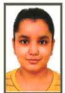
Blossam SSC-II Non Medical 3rd in School