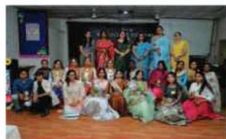
Exuberance 2023 Function by Department of Economics