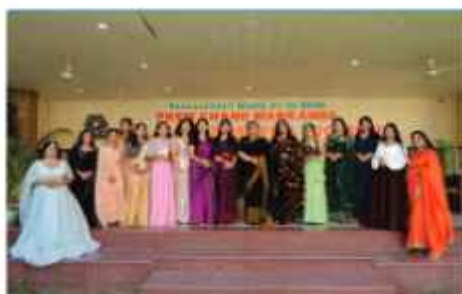
Party Make Up Competition by Department of Cosmetology