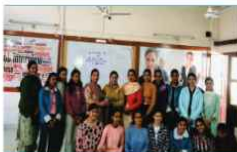
Guest lecture on "Guru Nanak Bani Vich Prakirti da Darshnik Chitran" by Guru Nanak Study Center