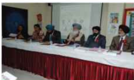
International Seminar by Department of Punjabi