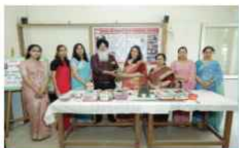
Workshop on Maths & Science by Department of Mathematics & Sciences