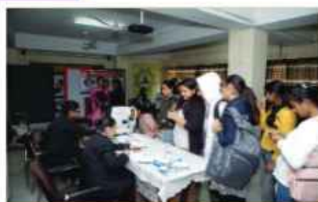
Eye Check-Up Camp