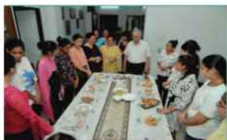
Cooking Competition by Department of Home Science