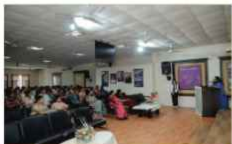
Workshop on the topic "Breaking the silences- Writing Women's Experiences" by Department of English