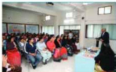
International Guest Lecture on "Ajoke Pidi Da Vedeshan Wal Ruzhaan" by Department of Punjabi and History