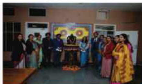
International Conference by Department of History and Punjabi