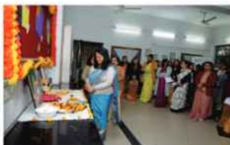
Saraswati Pujan & Basant Panchami