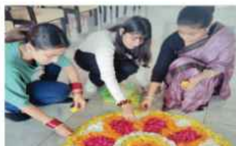
Students of Department of Fine Arts Decking College Premises