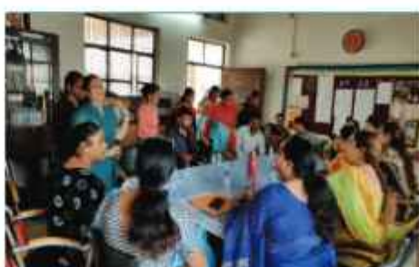
Parent Teacher Meet