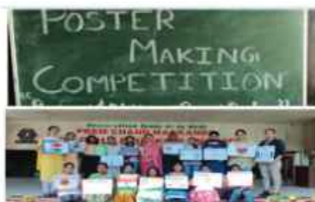
Poster Making Competition by Department of Political Science