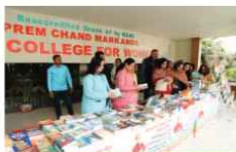
Books Exhibition - cum - Sale by Vivekanand Study Center