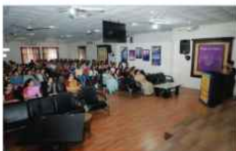
Orientation of First Year Students