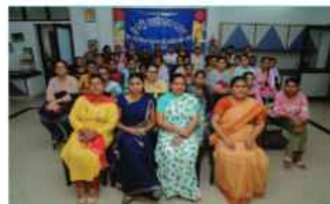
Celebration of Hindi Divas by Department of Hindi