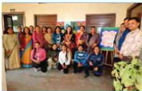
Celebration of Maat Pita Santan Divas