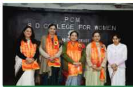
Bhashan Patriyogita by Department of Sanskrit