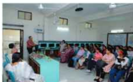
Guest Lecture on unsung Heroes of Indian Freedom Struggle by Department of History