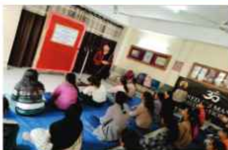
Seminar on Stress Management by Department of Psychology