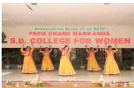
Students of Department of Dance Performing Sufi Form