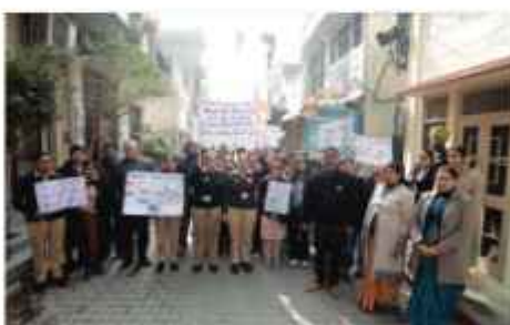
Rally on Voter's Day