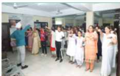
Workshop on Self Defence by Women Empowerment Cell