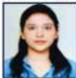
Dolly B.Com (Sem-VI)