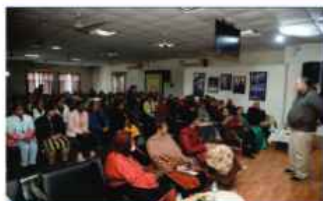
Seminar on start Up Eco System and Entrepreneurship by P.G. Department of Commerce and Management