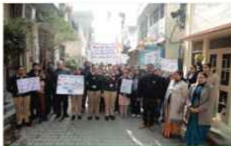
Rally on Voter's Day