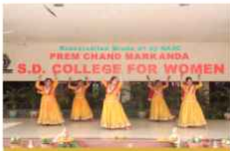
Students of Department of Dance Performing Sufi Form