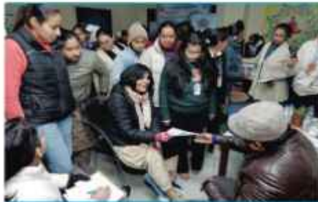
Bone Density Check-Up Camp