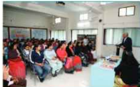
International Guest Lecture on "Ajoke Pidi Da Vedeshan Wal Ruzhaan " by Department of Punjabi and History