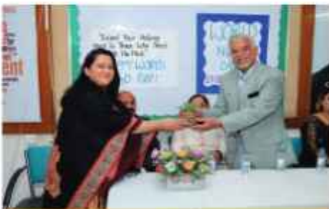
World NGO Day Celebration