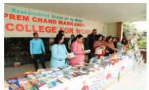
Books Exhibition - cum - Sale by Vivekanand Study Center