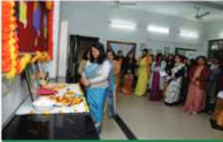
Saraswati Pujan & Basant Panchami