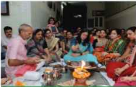
Starting the New Session with Havan Yajna