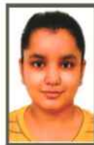
Blossam SSC-II Non Medical 3rd in School