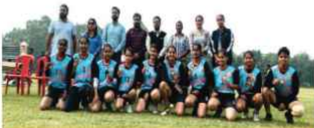
Our college achieved 3rd place in the Inter-College Rugby Tournament held on 6th to 7th November 2023 at GNDU, Amritsar.