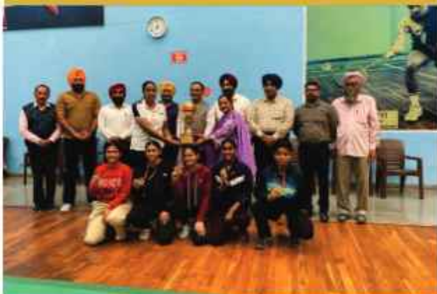
Our college triumphed in the Badminton Inter-College Championship held from 6th November to 8th November 2023 at Doaba College, Jalandhar.