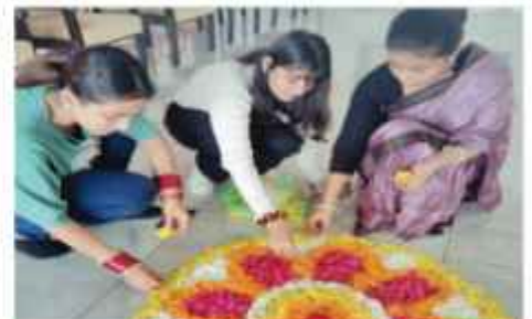
Students of Department of Fine Arts Decking College Premises