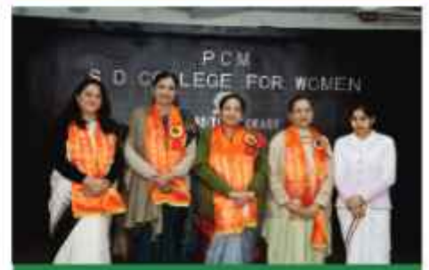
Bhashan Patriyogita by Department of Sanskrit