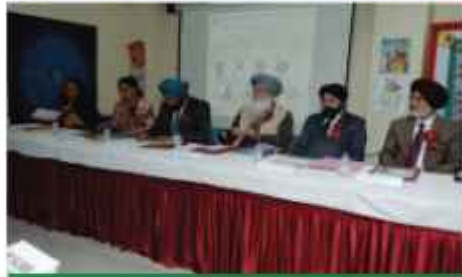
International Seminar by Department of Punjabi