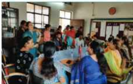
Parent Teacher Meet