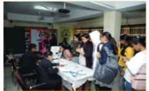
Eye Check-Up Camp