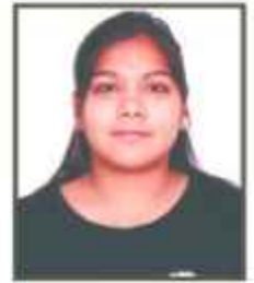
Simple Placed in Merit List in Univ. in B.Com Sem-II