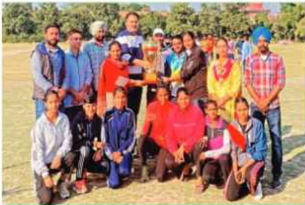
Our college clinched the championship at the 53rd Athletics Meet held from 16th to 18th November 2023 at GNDU, Amritsar.