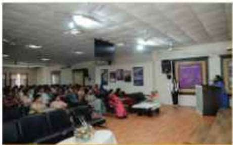
Workshop on the topic Breaking the silences- Writing Women's Experiences by Department of English