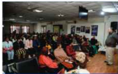
Seminar on start Up Eco System and Entrepreneurship by P.G. Department of Commerce and Management