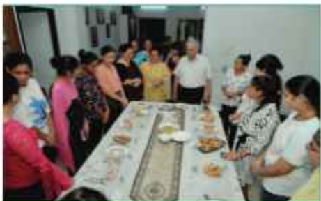
Cooking Competition by Department of Home Science