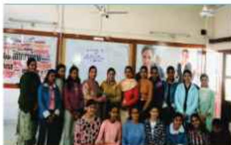
Guest lecture on "Guru Nanak Bani Vich Prakirti da Darshnik Chitran" by Guru Nanak Study Center