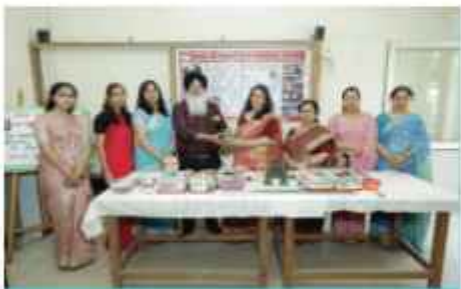
Workshop on Maths & Science by Department of Mathematics & Sciences