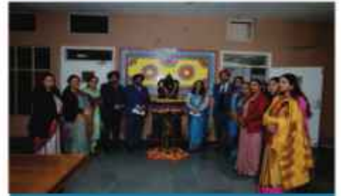
International Conference by Department of History and Punjabi