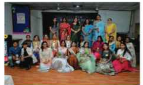
Exuberance 2023 Function by Department of Economics