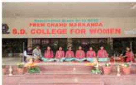
Group Bhajan by Department of Music