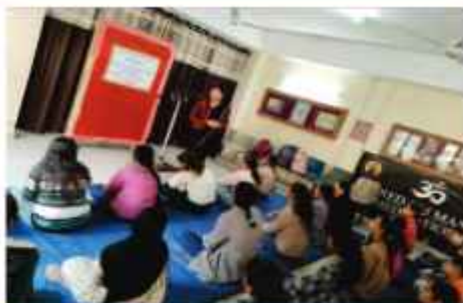
Seminar on Stress Management by Department of Psychology