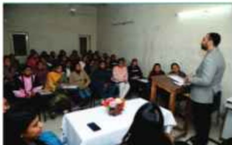
Seminar on Entrepreneurship By Department of Fashion Designing