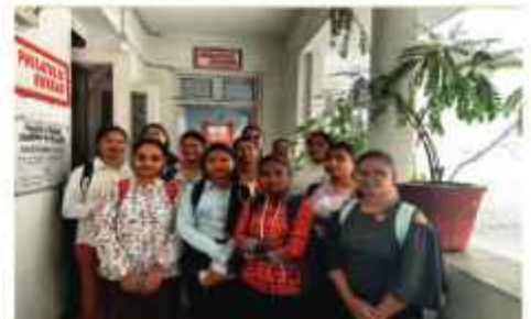
Visit to Philatelic Museum by Department of Office Management and Secretarial Practice