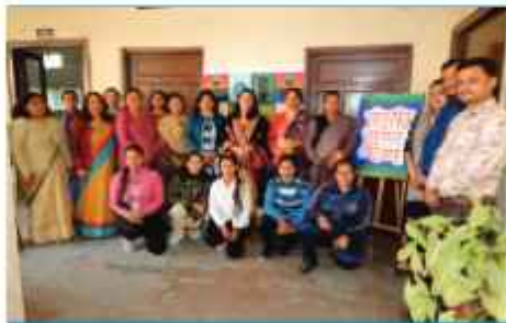
Celebration of Maat Pita Santan Divas