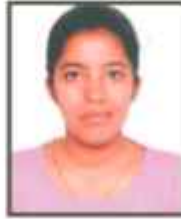
Vinoet Passed with Distinction in Univ. in B.Sc. CS Sem VI