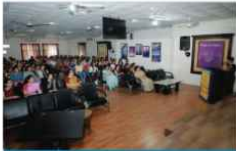
Orientation of First Year Students