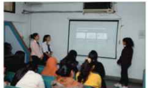
Power Point Presentations by Students of Department of Computer Science & IT