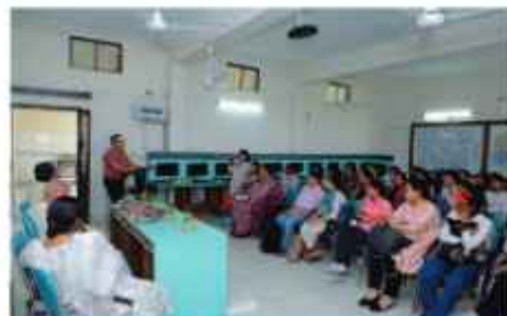
Guest Lecture on unsung Heroes of Indian Freedom Struggle by Department of History