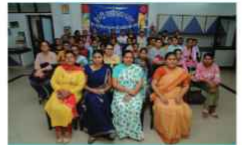
Celebration of Hindi Divas by Department of Hindi