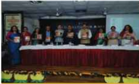
ICHR Sponsored National Seminar by Department of History