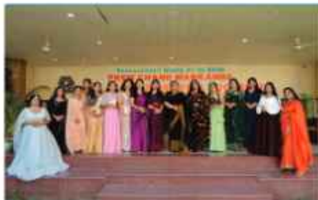
Party Make Up Competition by Department of Cosmetology