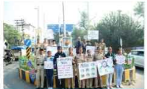
Awareness Programme on International Millets Day