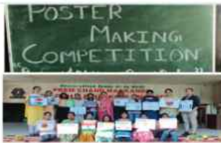
Poster Making Competition by Department of Political Science